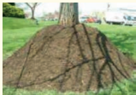
Volcano mulching suffocates surface roots of trees.