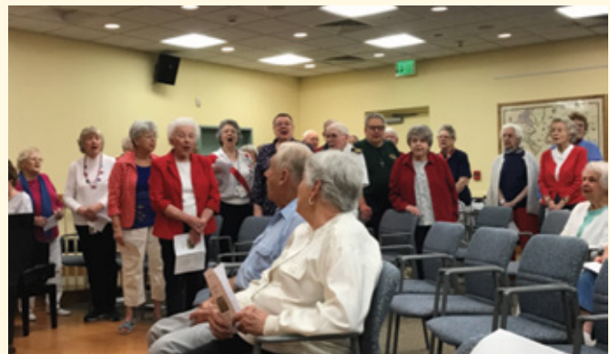
Gwynedd Estates Choir sings at Memorial Day Event at Gwynedd Estates.