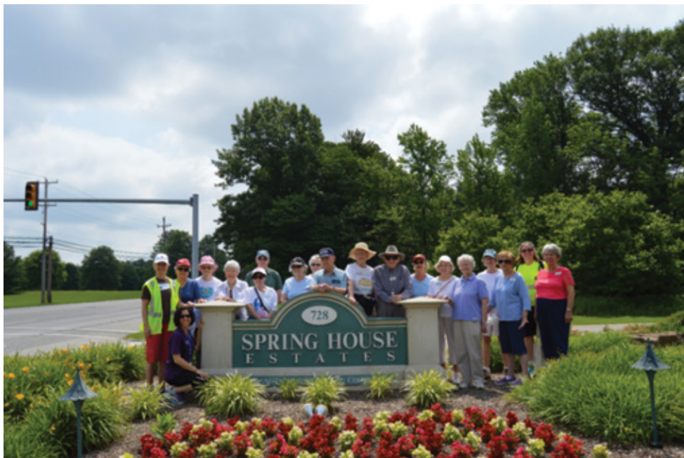
Spring House Estates residents enjoy walking the many Lower Gwynedd Township Trails.

You can then access under: the "search" feature, browse under "Code" or review "New Laws"