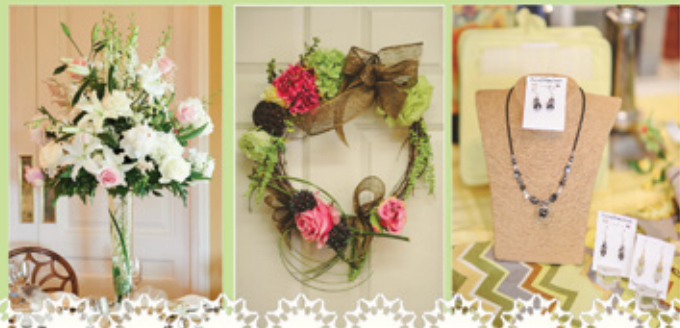
Flowers Silks Gifts