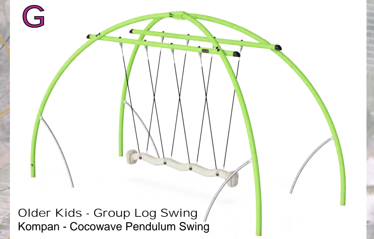
G Older Kids - Group Log Swing Kompan - Cocowave Pendulum Swing