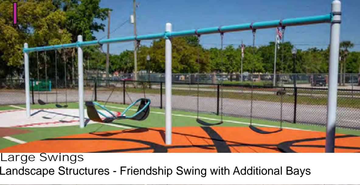
I Large Swings Landscape Structures - Friendship Swing with Additional Bays