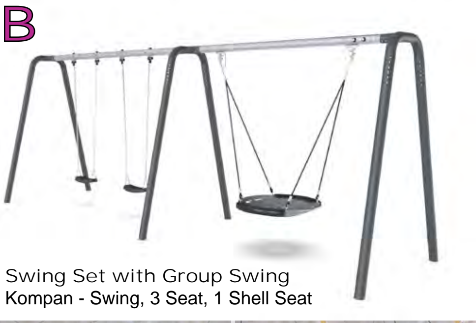
B Swing Set with Group Swing Kompan - Swing, 3 Seat, 1 Shell Seat