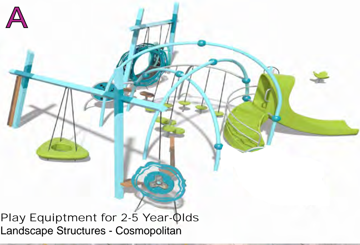
A Play Equipment for 2-5 Year-Olds Landscape Structures - Cosmopolitan