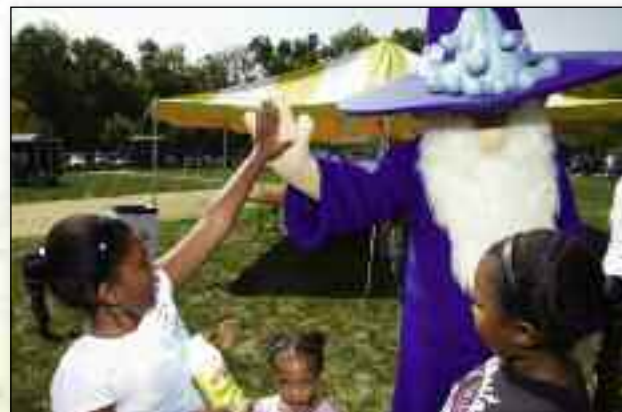
North Wales Water Wizard greeting children.

Also, don’t forget to dust off those cook books and get practicing on Grandma’s famous recipe - the Bake-Off is looking for those