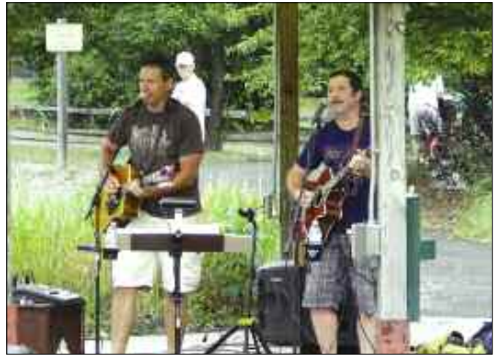
Mango Men, Summer Concerts Oxford Park.

The “I Like The Pike” initiative has also been a catalyst for the creation of the new Lower Gwynedd Business Association. The Lower Gwynedd Business Association is a group of local business owners and professionals working together to improve the business