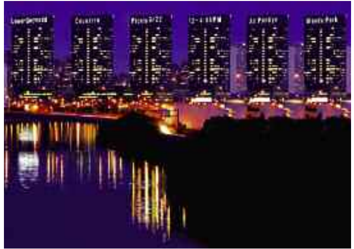
Countrie Picnic in the PECO crown lights.

So make sure to come out and support your local restaurants and businesses! The Countrie Picnic is the perfect opportunity to celebrate all that Lower Gwynedd has to offer.