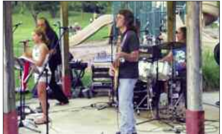
Flower Power, Summer Concerts Oxford Park.

“We have several properties that have great development